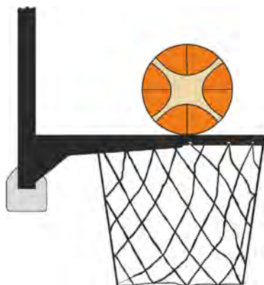
Diagram 2 Ball in contact with the ring

31-15 Statement. Interference violation is committed by a defensive or offensive player during a shot for a field goal when a player touches the basket or the backboard while the ball is in contact with the ring and still has a chance to enter the basket.