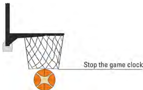
Diagram 1 A goal is scored

16-10 Example: At the begin of a quarter, team A is defending its own basket when B1 erroneously dribbles to his own basket and scores a field goal.